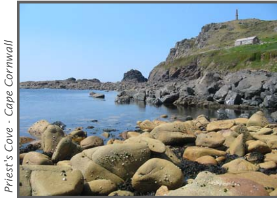
Priest's Cove - Cape Cornwall