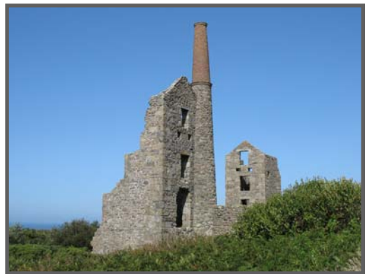
Carn Galver Mine