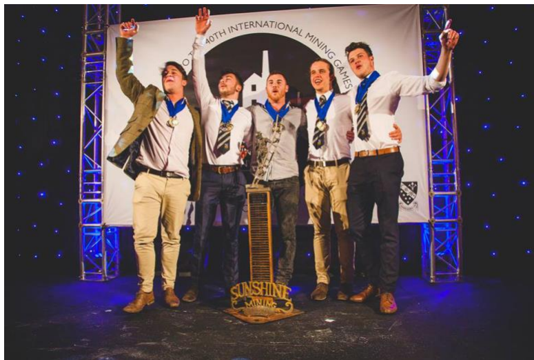
CSM men's Sandvik team.

The 40 th International Mining Games was held at King Edward Mine near Camborne in March, and was a fantastic success. The men's competition was won for the first time by Camborne School of Mines Sandvik team, and the CSM woman's A team were joint winners with Western Australia School of Mines. The co-ed event was won by Team Hammerslagen and the alumni event by Western Australia School of Mining Alluminati. Congratulations to all of the teams that took part in the 3 day event. The weekend was rounded off at Heartlands in Pool with a visit by the Man Engine at the start of its resurrection tour. More information is available at the CSM IMG website ( www.csmimg.com ). Next year the 41 st IMG is being hosted by the University of Nevada, Reno, USA between the 20 th and 23 rd March 2019